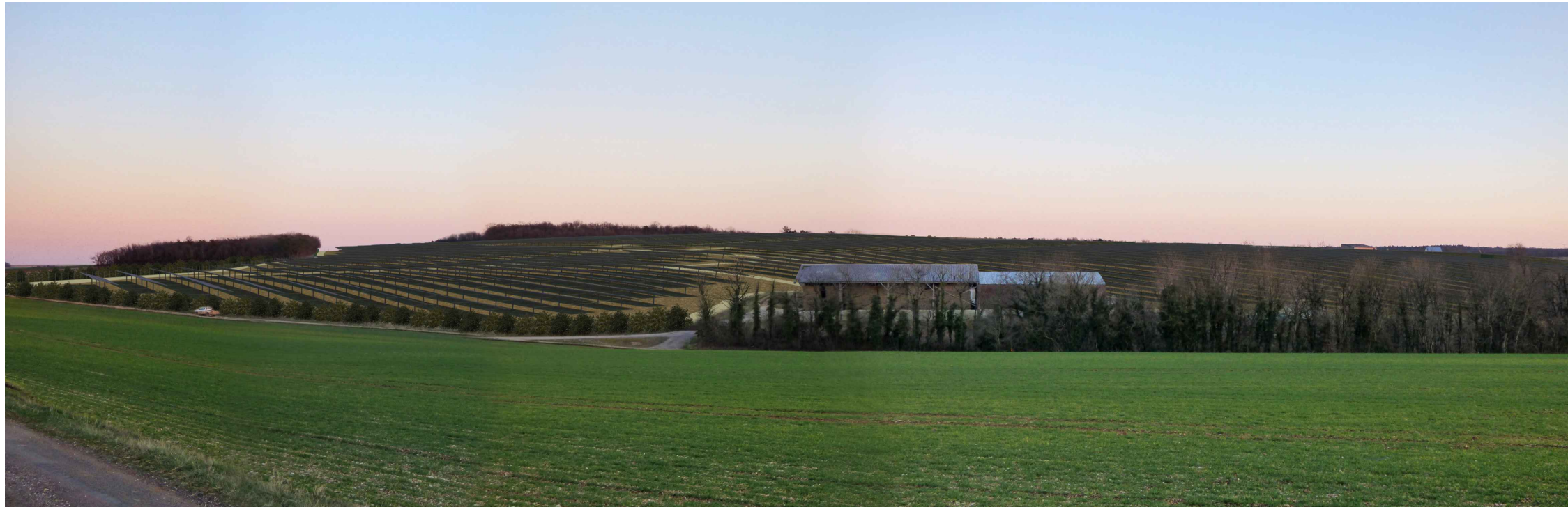
INSERTION AVEC HAIES PAYSAGERES