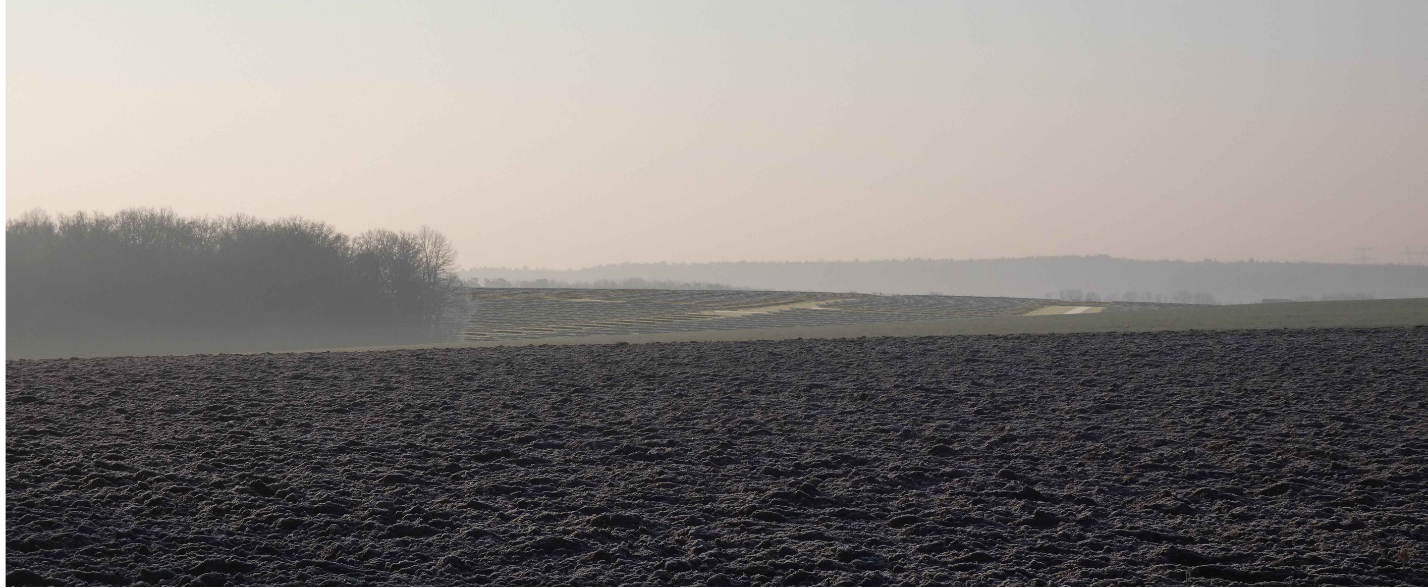
INSERTION AVEC HAIES PAYSAGERES