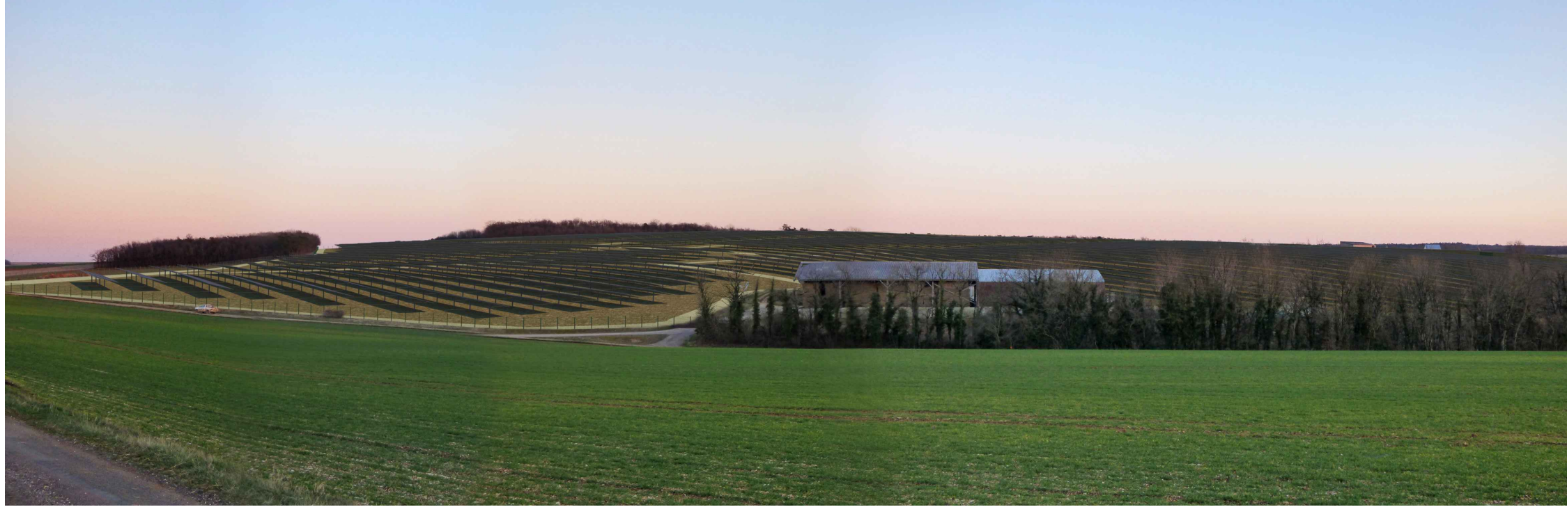
INSERTION SANS HAIES PAYSAGERES